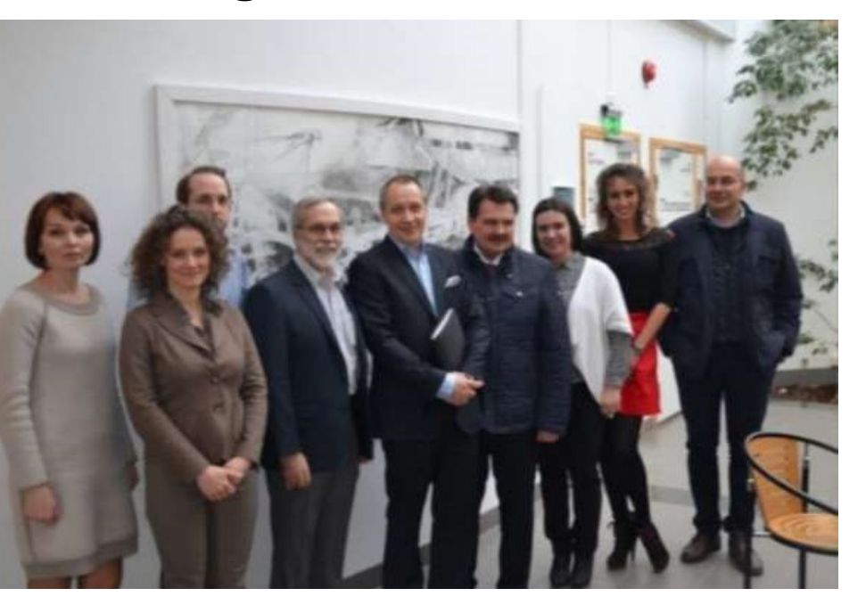
Meeting at NUBS, 2016.