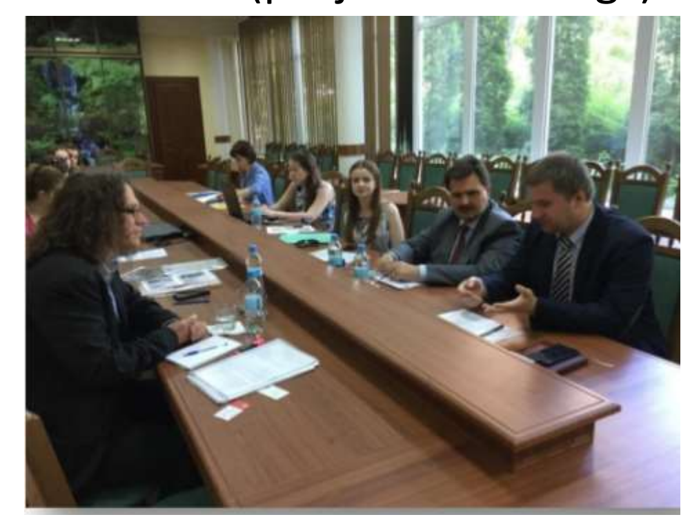
Meeting at KNU, 2017.